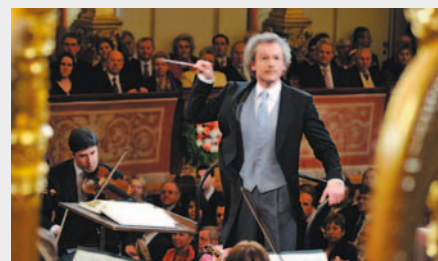
Picture of F. Welser-Möst conducting the 2011 New Year's concert.

Also in medicine Vienna derives its strong roots from its history. But after 120 years of academic service for dermatologists through the Austrian Society of Dermatology, we also ask the question: How will the future of global dermatology look like? What are the needs of dermatologists in the clinic and in private practice?