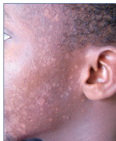
Fig. 4: Pityriasis versicolor of the face and hyperpigmentation of temples