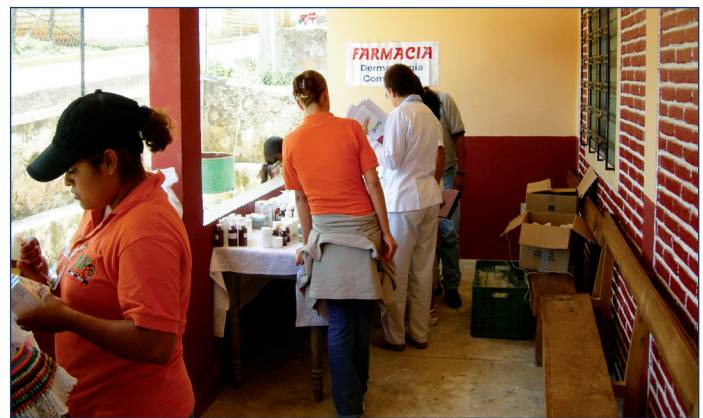
Community Dermatology Pharmacy in Mexico

The International Foundation for Dermatology (IFD) was established over 20 years ago and is part of the International League of