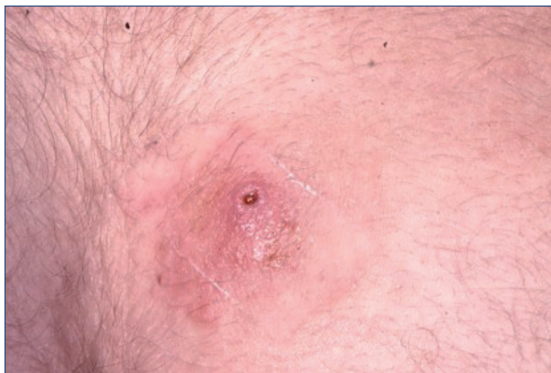
Fig. 2: Truncal furunculoid lesion due to Dermatobia hominis

It is usually possible to extract Cordylobia larvae by applying gentle pressure around the margins of the lesion. Improved hygiene and sanitation can reduce the incidence of infestation. It is worth considering oral ivermectin in a patient with multiple lesions.