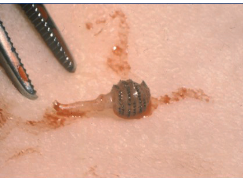
Fig. 3: Larva of Dermatobia hominis , extracted surgically from the lesion in Fig. 2. Note the multiple spines