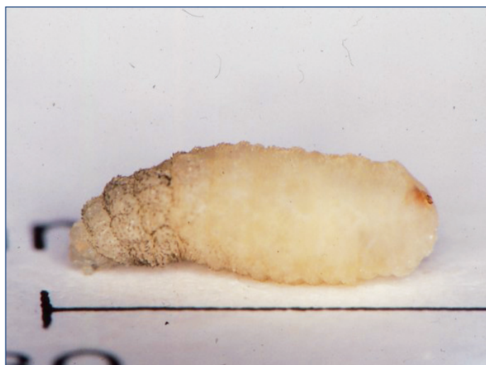
Fig. 1: Larva of Cordylobia anthropophaga , extracted from a European businessman who was working in the Congo

Facultative myiasis can occur in neglected ulcers and wounds, particularly in the tropics. Maggots can effectively reduce wound slough and 'larval therapy' has proved an effective form of ulcer debridement. Cutaneous myiasis is usually caused by obligatory parasites. The commonest form is furunculoid (boil-like) myiasis . Usually, larvae develop in the area of skin where they penetrate, although genera such as Hypoderma may migrate to the skin from the gastro-intestinal tract. Sometimes Hypoderma larvae move slowly through sub-cutaneous tissue, inducing a florid urticarial response, sometimes with eosinophilia; this is distinct from 'creeping erup-