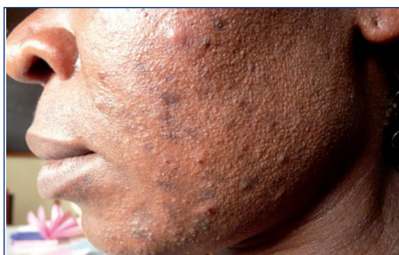
Fig. 5: Acne vulgaris and post-inflammatory hyperpigmentation