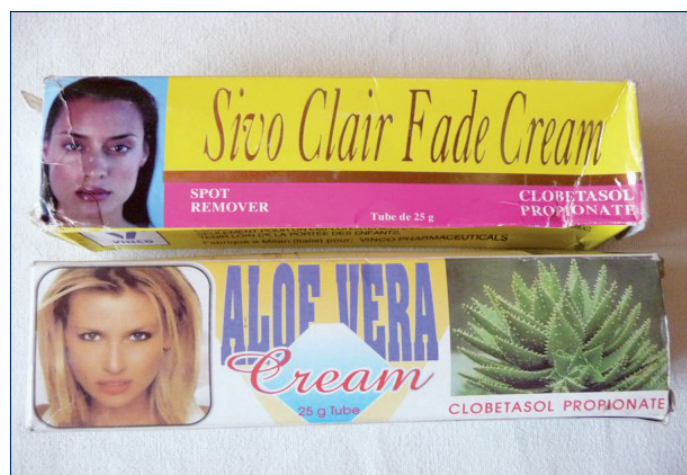
Fig. 1: A cream which suggests that it contains natural aloe vera actually contains clobetasol propionate

Exogenous ochronosis presents with an asymptomatic deep blue/black pigmentation in sun-exposed areas. In the late stages, there are numerous tiny black papules. There may also be pigment deposition in the cartilage of the ear (Figure 2). There are characteristic histological changes, with degeneration of the collagen and elastic fibres and deposition of ochre-coloured fibres in the dermis. Ochronosis is a strong indication of the prolonged use of hydroquinone. It is extremely disfiguring and is almost impossible to treat. The majority of reported cases have been from Africa. However, antimalarials may also produce ochronosis, and, therefore, it is possible that some of the cases may have been due to the intake of antimalarials at the same time. 3