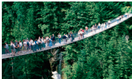
Cap Suspension Bridge M. Dorigo