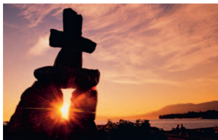
Inukshuk Sunset English Bay