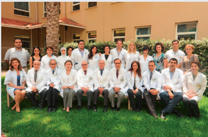
Group photograph, Department of Dermatology, American University of Beirut Medical Center

In conclusion and in my capacity as a Chair of the Department and as a board member of the ILDS, If I have reached out and touched at least one person per annum over the course of nearly a quarter of a century of teaching at this outstanding department and in the board, I realize with a joy coupled with humility that I have reached out and touched the lives of many, many people, and, in return, they too have reached out and enriched my world of dermatology.