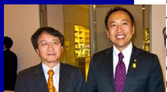
President of the Annual Conference of the Central Division of the Japanese Dermatological Association, Osaka, October 2012