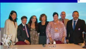
Brazilian Dermatology Society Centennial Celebration, Rio de Janeiro, September 2012