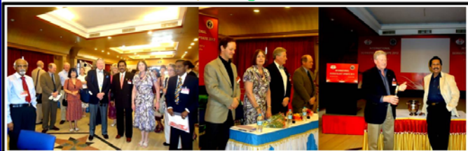
Indian Society of Teledermatology in CME partnering IADVL Chennai City Branch