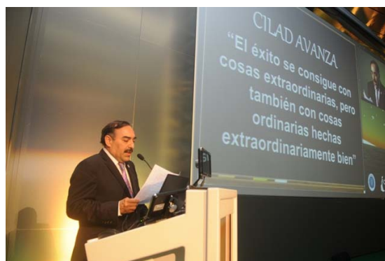
Opening Ceremony CILAD XIX Congress Seville

Also, during that Ordinary Assembly, it was decided that the venue of the XXI Ibero Latin American Congress of Dermatology will be Buenos Aires, Argentina, during October 2016.