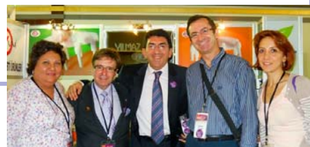
Turkish National Dermatologic Congress, Gaziantep, Turkey,