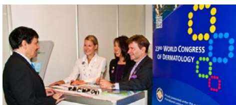
WCD 2015 Booth at EADV, Prague, September 2012