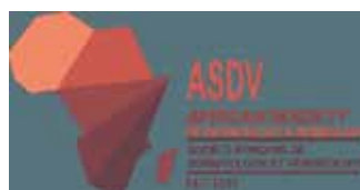
African Society of Dermatology and Venerology