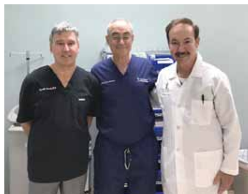
IPS Workshop St. Petersburg