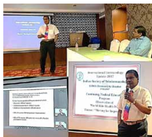
INSTED CME event