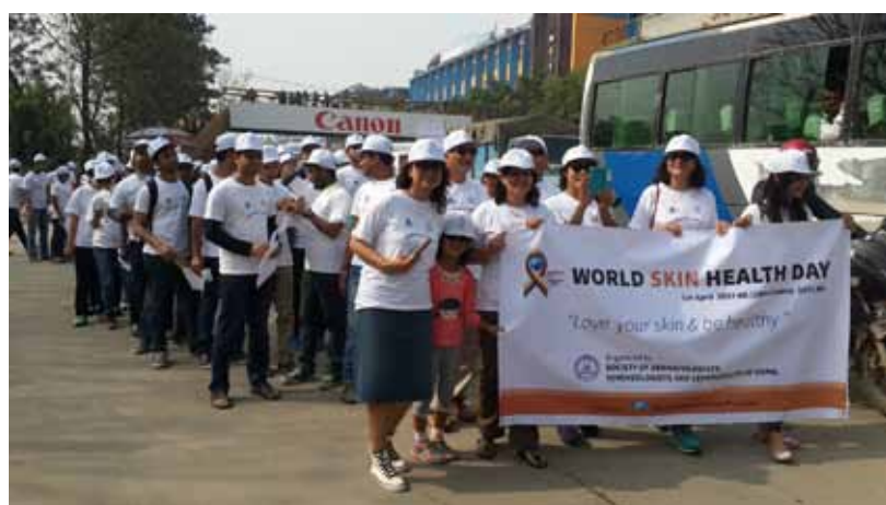
SOVELON awareness rally