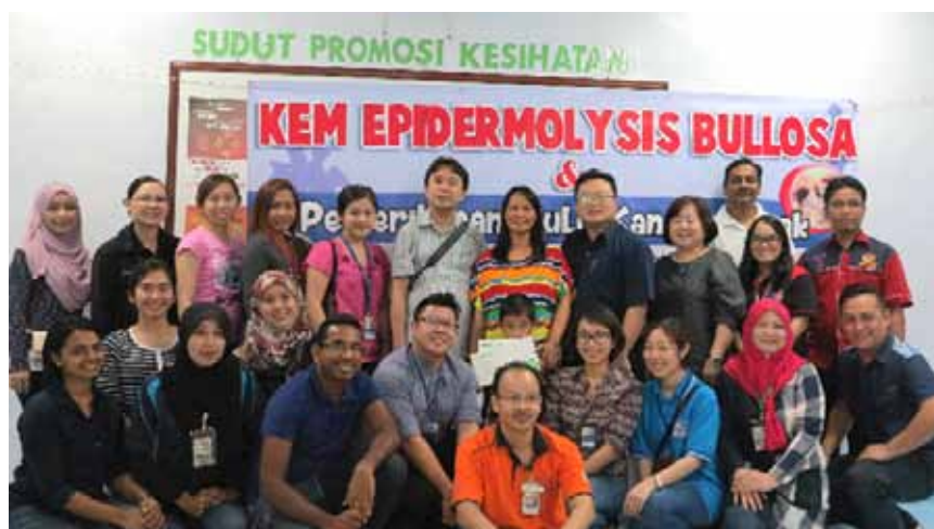
DSM Group Photo of Dermatology Community Outreach Clinic at Pitas, Sabah, Malaysia