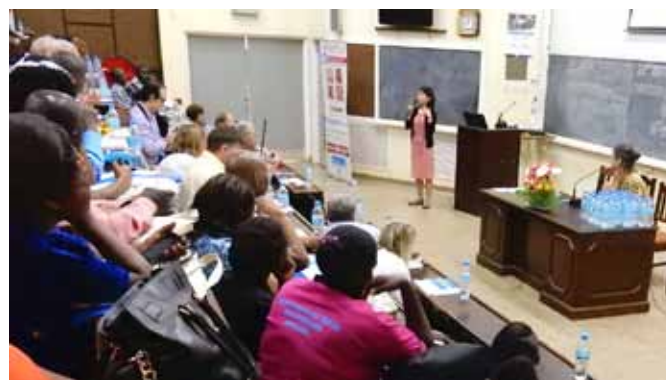
Regional Dermatology Training Centre, Tanzania, CME